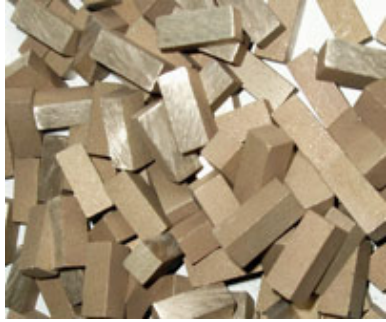
Diamond segments Tips for Concrete Grinding