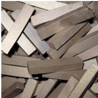
China Marble diamond segment manufacturers & suppliers