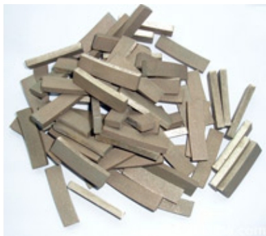
China 600mm Granite Cutting Segments Manufacturers